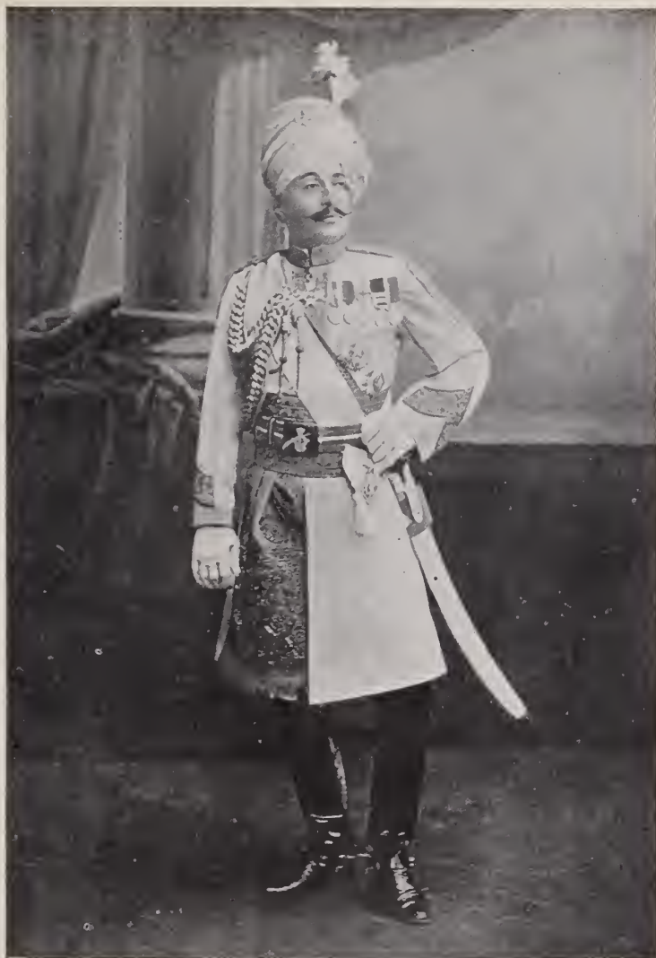
Major-General His Highness Maharaja Sir Pratap Singh, Regent of Jodhpur, G C.S.I., G.C.V.O., K.C.B., A.D.C.